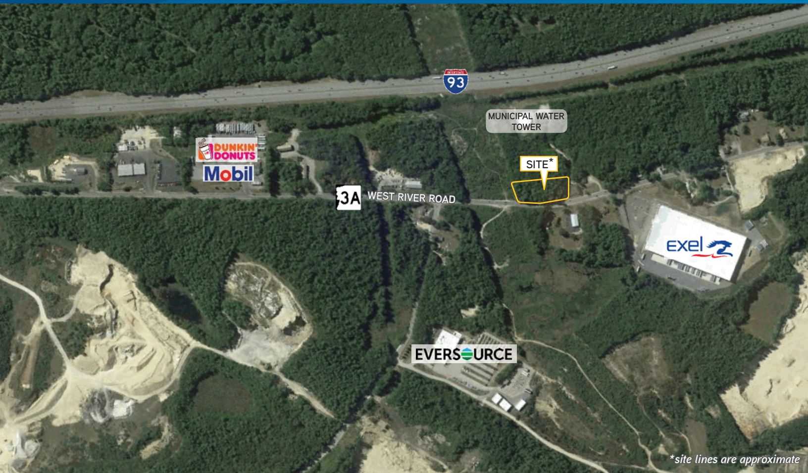
*site lines are approximate