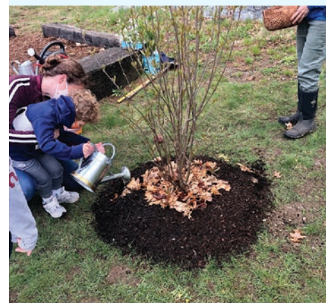
Eversource arborists celebrated Arbor Day by planting trees with students at Country Elementary School in Weston.

On World Environment Day, Earth Day, Arbor Day and all year round, our employees enjoy taking time to care for Mother Earth. This spring season, the Eversource team cleaned up neighborhoods, local parks and riverways during our week-long Earth Day volunteer event, and recognized Arbor Day by planting trees and donating 2,000 saplings.