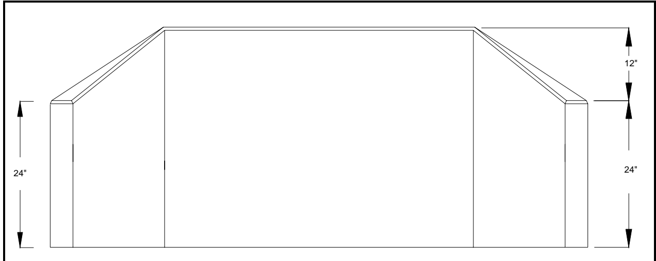
Figure 2 - Retaining Wall (Front View)